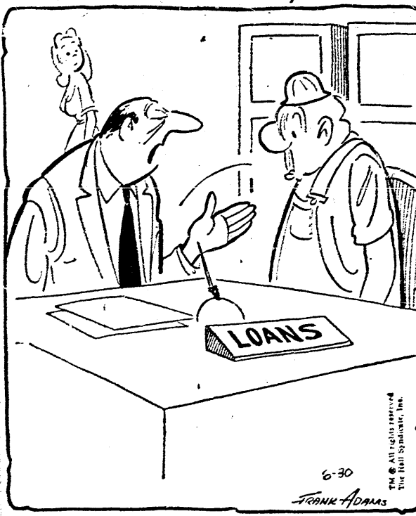
"We just agreed to help you consolidate your debts and pacify the bill collectors... We didn't offer asylum..."

THE SAN DIEGO UNION a20 © Tues., June 30, 1959 SAN DIEGO, CALIFORNIA