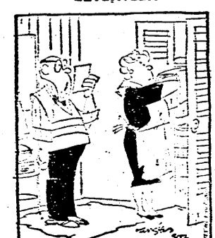
"A born doctor . . . the boy can't write anything anybody can read."